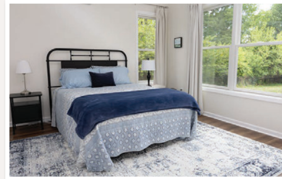
The bedroom has three windows that were in the original plans. Karen requested a fourth window on the side wall because she wanted a cross-lighting effect.