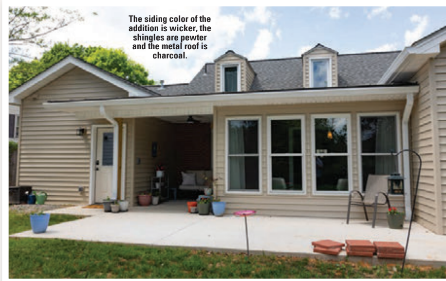
The siding color of the addition is wicker, the shingles are pewter and the metal roof is charcoal.

including when different tradesmen had to work on things at the same time. Walters continuously coordinated getting someone into the house to complete work without large, unnecessary lags between different projects.