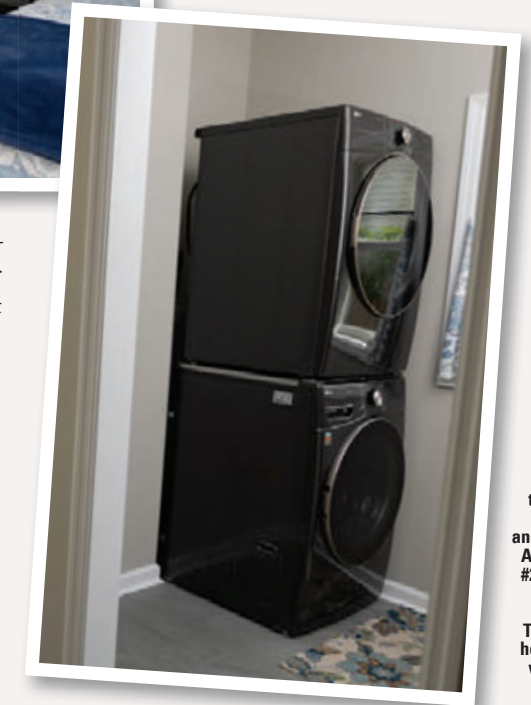
The tile in the mudroom, laundry room and sun room is Adrock Nickel #27 with silver grout from Morris Tile. The rest of the home is luxury vinyl flooring.

Project manager Walters says, “The best remodels aren’t always the grandest; it’s often the small, thoughtful changes that make the biggest impact in the functionality and comfort of your home and maximize your budget.”